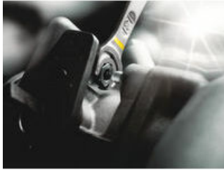
Joker open-ended wrench