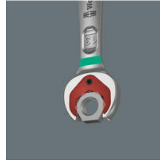
Ring ratchet spanner Joker 6000

The Joker's holding function means that nuts and bolts can be held in the jaw and easily positioned where they are needed. Fastening on to the thread can then be done quickly and safely, thanks to the innovative special stop-plate which holds the fastener. No more time-wasting searches for dropped nuts and bolts! After applying and positioning the nut or bolt, fastening can begin immediately - no additional tools required.