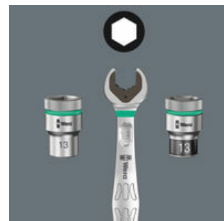
"Take it easy" tool finder

Take it easy tool finder system - with profile and size colour-coding for quick and easy tool selection. Colour-coded system for hexagon drive screws (L-Keys, Zyklop bit sockets), external hex drive screws and nuts (Joker wrenches, Zyklop sockets and Zyklop bit sockets with holding function), and TORX® drive screws (L-Keys, Zyklop bit sockets).