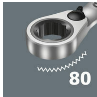
Fine tooth mechanism

The ratcheting feature at the ring end boasts an exceptional, fine tooth mechanism - 80 teeth in all - which provides greater flexibility, even in very confined workspaces.