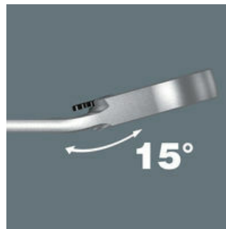
Angled ratchet end

The ratchet end is angled at 15° to the tool axis, making application of the tool in confined spaces much easier.